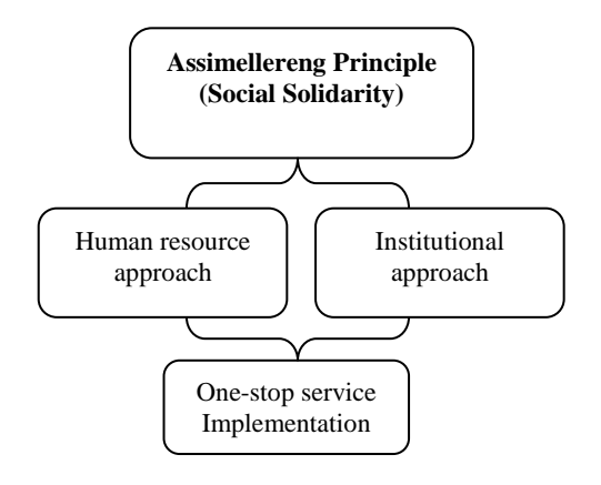
FIGURE 2 OSS IMPLEMENTATION MODEL

The Figure 2 shows an institutional approach combined with a human resource approach based on Assimellereng principles in the implementation of the OSS program which contains the following meanings (Said, 2013).